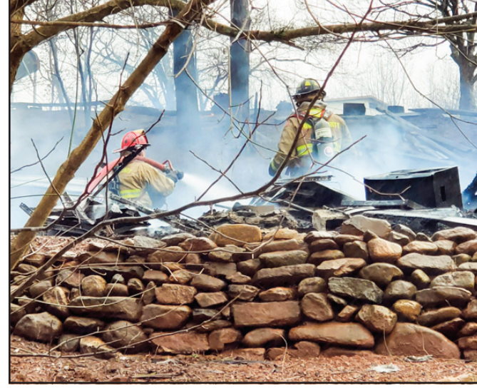
Towns County firefighters working to put out this Jan. 16 house fire on Upper Bell Creek Road across from Bell Scene Baptist Church.

Compounding the inclement weather difficulty was the fact that, based on information provided by family memresident may have still been stayed out. inside the home, which was fully involved in fire.